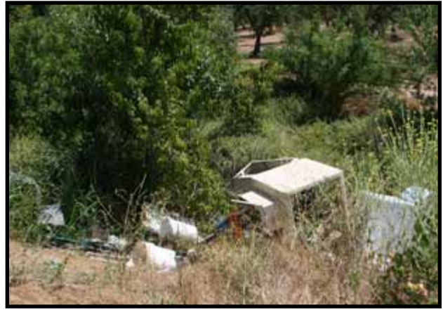
Illegally dumped items at a Farm & Ranch Cleanup site