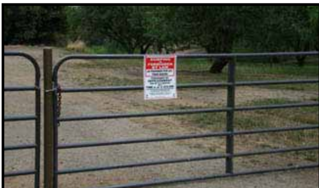
Fence and “No Dumping” sign installed

If you know of a site in Colusa County that may be eligible for cleanup through this CalRecycle grant program, or if you have any questions, please call the Colusa County RCD at 530.458.2931 X3