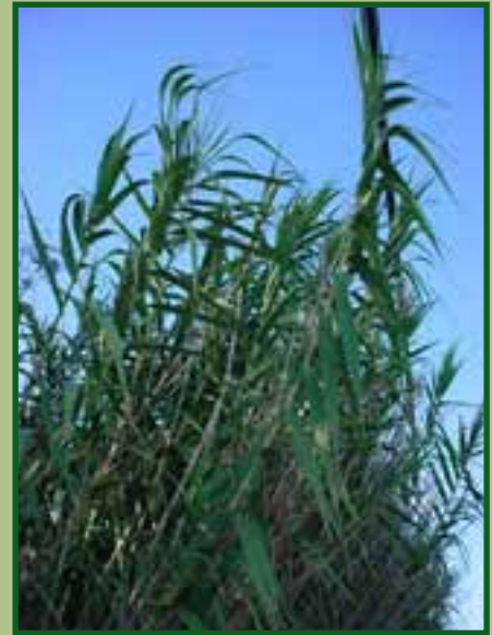
Arundo donax, Giant Reed