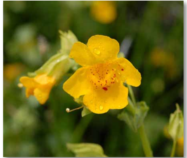
Seep monkey flower, Mimulus guttatus