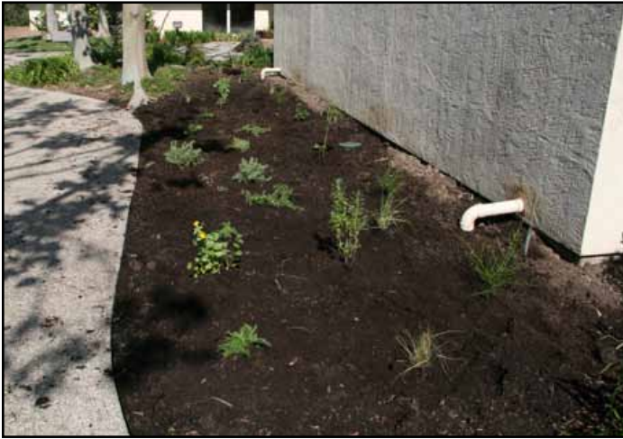
The garden in May, just after planting

Earlier this year, our generous landlord at the Colusa Industrial Park agreed to allow the CCRC D to install a native plant garden in front of our building. CCRC D staff ordered plants from Floral Natives Nursery in Chico and the garden was installed in May. Plant species include: California Wild Rose, Mexican Elderberry, Western Red Bud, Dwarf Coyote Bush, Ceanothus Blue Blossom, Yarrow, California Fuschia, Seep Monkey Flower, Cleveland Sage and Deer Grass. Most of the plants are thriving and growing beautifully. Currently the Yarrow, Elderberry and California Fuschia are in bloom. Happy little hummingbirds have recently been spotted enjoying the Fuschia!