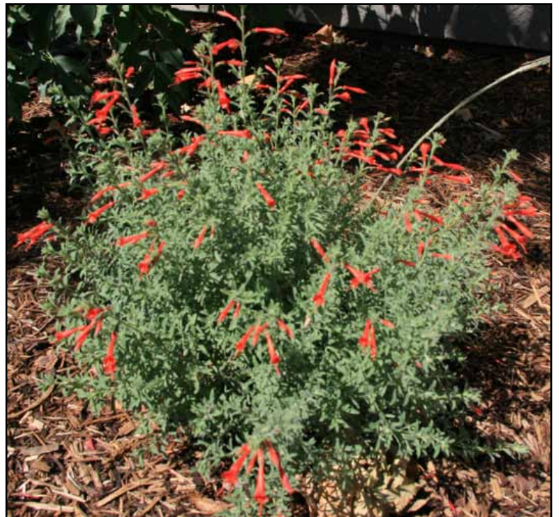
Hummingbird heaven - California fuschia blooming in August