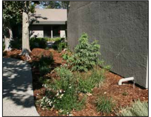
The garden in August