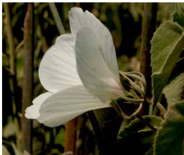
Rose mallow, photo by Jack Alderson