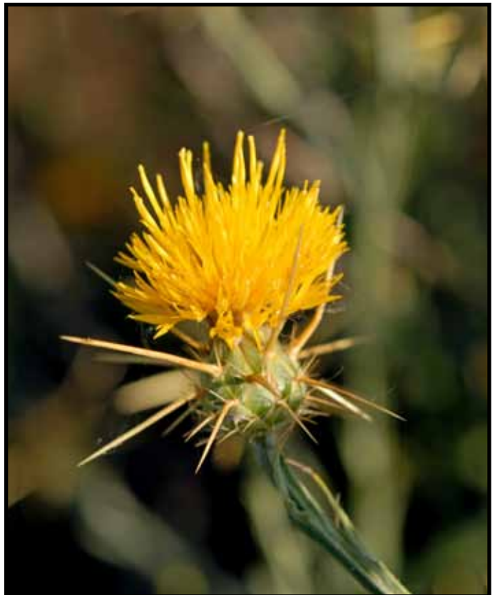
Yellow starthistle